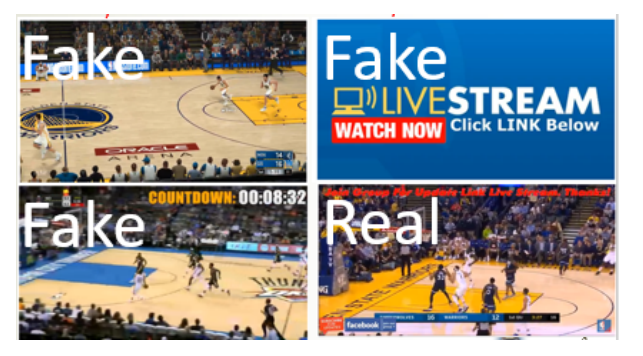
Figure 2: Live Videos on YouTube

An example of the above definitions is shown in Figure 2. We observe that all four pictures are related to a copyrighted NBA game and claimed to broadcast the live events for free. However, only the last one (bottom-right) should actually be labeled as "True" (i.e., copyright-infringing) and the others should be labeled as "False". For example, the top-left video is a game-play video of an NBA 2K game. The top-right one is just a static image and the bottom-left one is broadcasting an old recorded match.